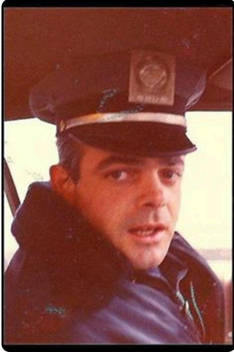
Pops, aprox 30yrs old.